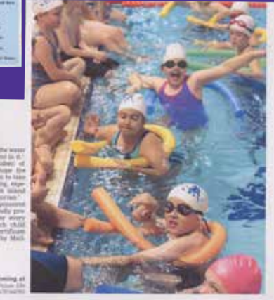
Primary schools swimming at Langford this week

A RECORD number of young islanders have taken to the water this week for the annual Primary Schools Swimming Festival.